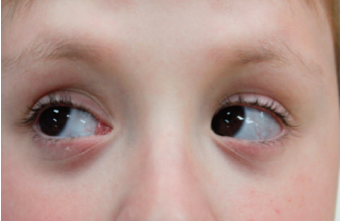
Figure 1. Image of the blue sclera.

Surgery is used to correct or reduce the deformities and to stabilise the fractures of the long bones or the spine.